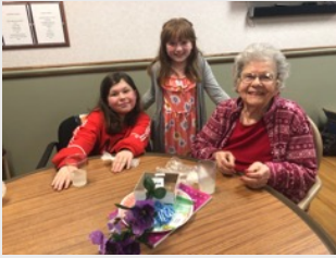
North Iowa Christian School doing crafts with our residents.