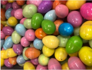
Our residents made over 1,400 eggs for our Easter Egg Hunt!