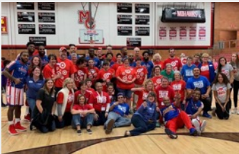
The IOOF volunteering during the Harlem Globetrotters at Mason City High school.